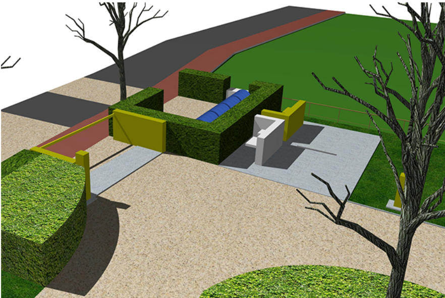
USCITA, AREA SERVIZI ED ISOLA ECOLOGICA